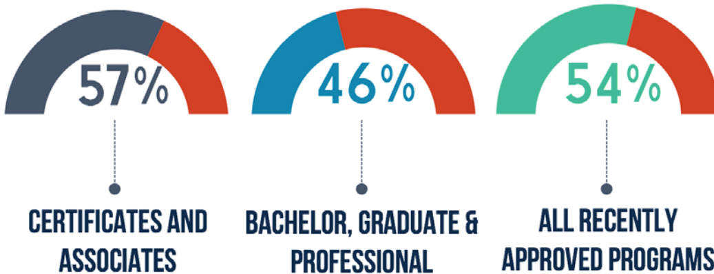
Figure 5.3.: Program Viability by Degree Type