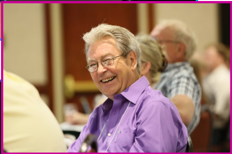
The faces and people of Day with Appraisers