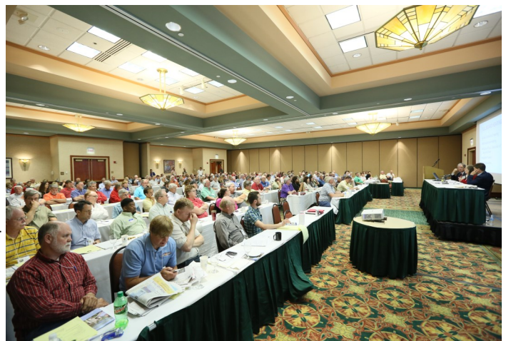
2014 Day with Appraisers at Little Rock Embassy Suites