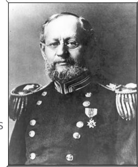
General Henry Robert