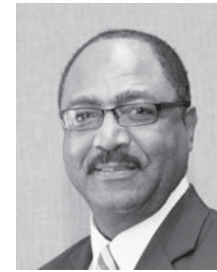
Mayor James Sanders Blytheville Public Safety