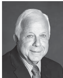
Mayor Joe Dillard Mountain Home