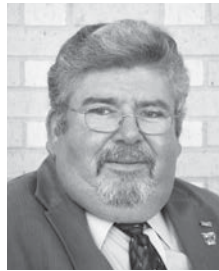
Mayor Scott McCormick Crossett