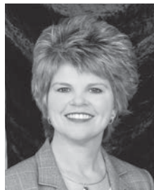
Mayor Virginia Young Sherwood