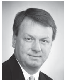
Mayor Tab Townsell Conway 2007