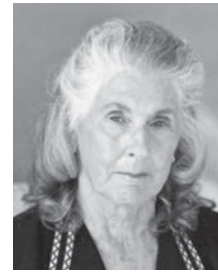
Mayor Bobby Bailey Alpena Small Cities and Towns