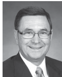
Mayor Gary Baxter Mulberry