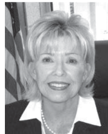
Mayor Debe Hollingsworth Pine Buff