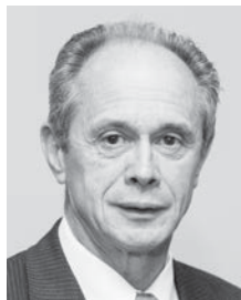
Mayor Gary Fletcher Jacksonville—District 2