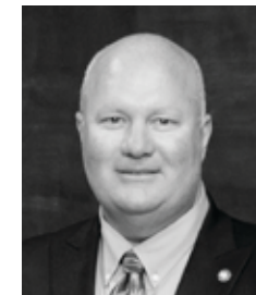
Mayor Parnell Vann Magnolia—At-Large