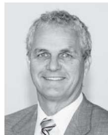
Mayor Doug Sprouse Springdale