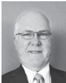
Mayor Doyle Fowler McCrory