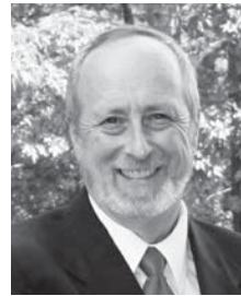
Mayor Lioneld Jordan Fayetteville