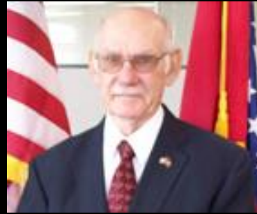
Commissioner C.S. Walker Grant County Election Commissioner Governor's Designee