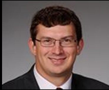
Commissioner Chad W. Pekron Speaker of the House Designee