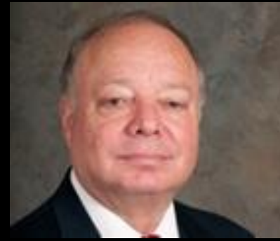
Commissioner Stuart "Stu" Soffer Republican Party Designee