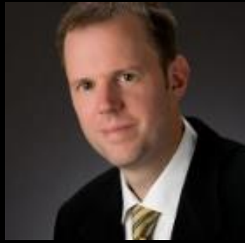
Commissioner J. Harmon Smith Democratic Party Designee